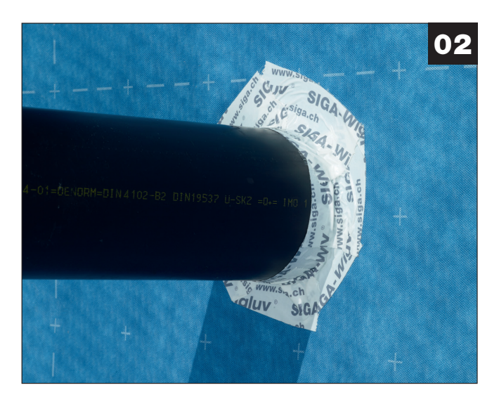
How it should look

All SIGA products are backed by a 10 year limited warranty. Reference www.sigacover.com for complete details. We want to you to maximize the performance potential of Wigluv on your project. Contact one of our Application Advisors for assistance, from architectural details to jobsite training.