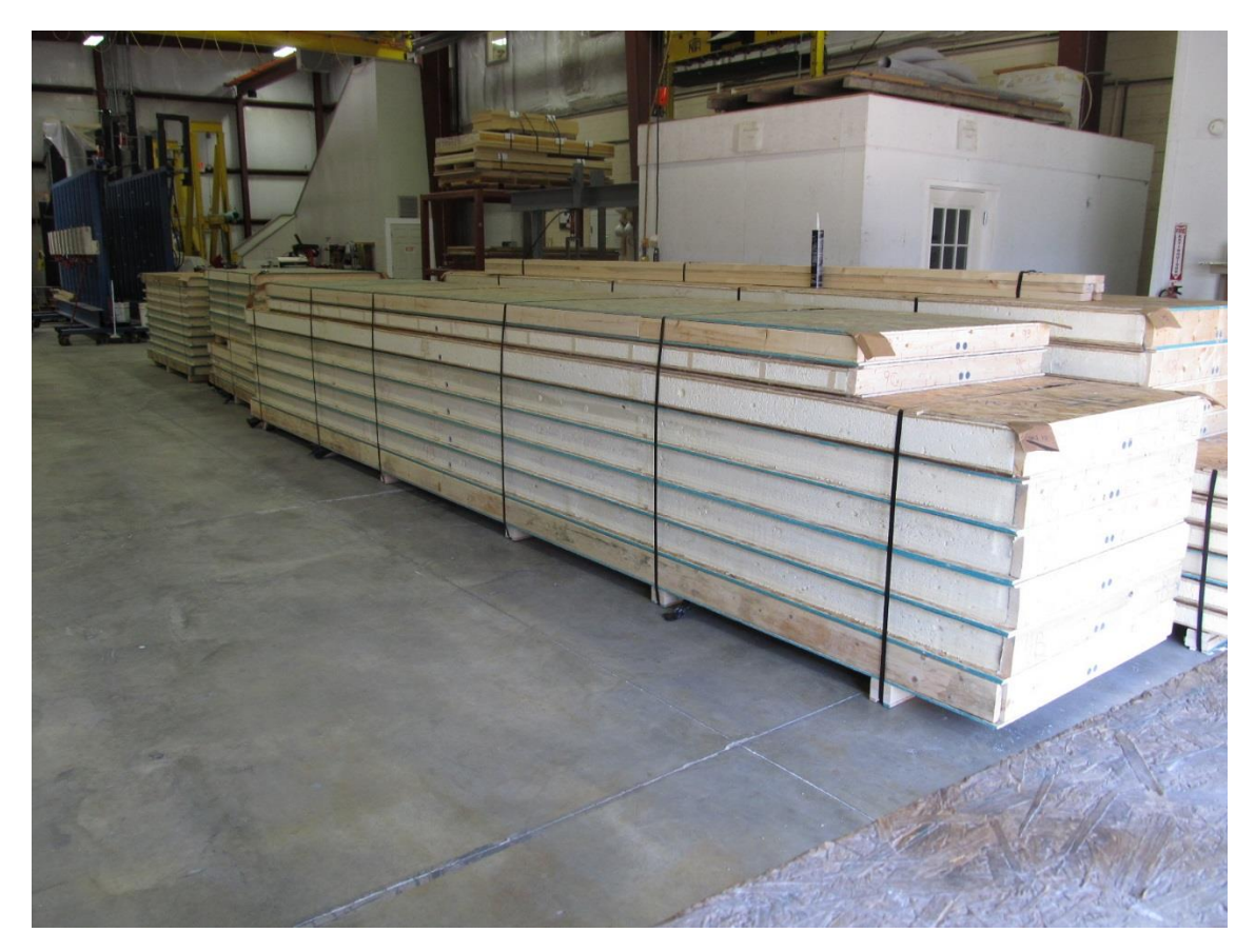
Figure 3: Net Zero SIPS LLC, Structural Insulated Panels

NTA Evaluation Report: NER-1017 Issued Date: 02/21/2019 This report is subject to annual review